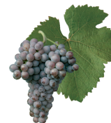
Rulandské šedé Pinot gris