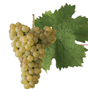
Ryzlink rýnský Riesling