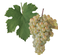
Veltlínské zelené Grüner Veltliner

The reason for this wide range of Moravian and Bohemian wines is also the combination of natural conditions and the work of human hands. There are more than a thousand wineries that do business in this field, from large companies to small family businesses in the Czech Republic. Thousands more small private winemakers produce wine for their own consumption. The final style of individual wines is not only determined by terroir, diverse terrain, differing soils and microclimate but also by the winemakers' inventiveness, experience, application of traditional methods and new trends. You can find everything but insipidness and mediocrity in original Moravian and Bohemian wines.