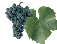
Rulandské modré Pinot Noir